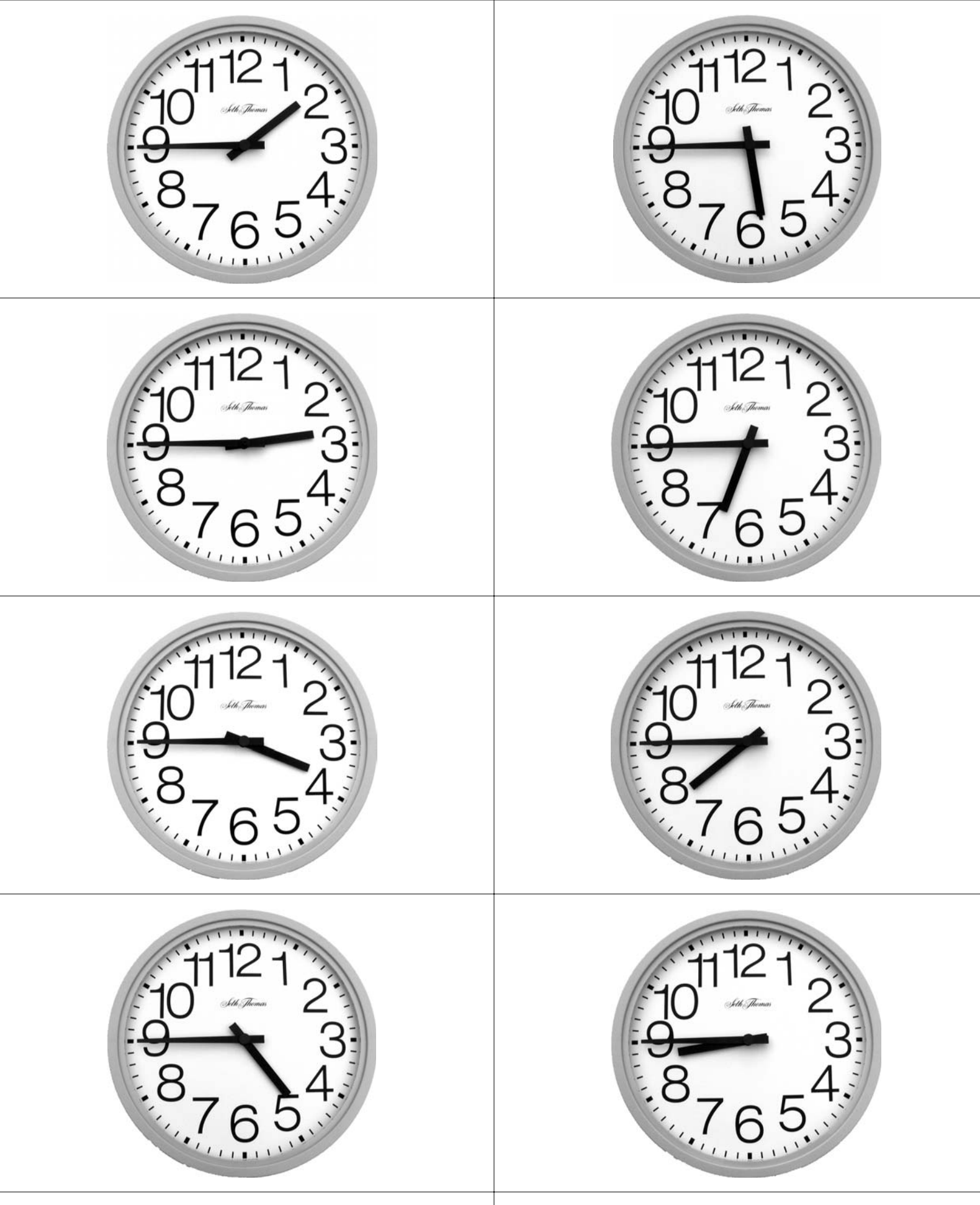
Directions: Print cards on 110 pound or other card stock paper. Print card backs on each page (optional). Cut out cards on the lines. Round card corners with corner cutter (optional).